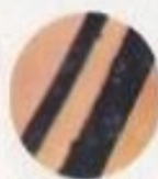
Left: An eyelash before Great-Lash. Right: An eyelash after Great-Lash.

Great-Lash, the protein mascara with the unique Builder-Brush, builds rich, full body onto every tiny lash with just a few quick strokes... so it's easy to put even skimpy lashes in the thick of things. The microscope proves the difference. See your lashes look as thick and luxurious as you've always wanted. Prove to yourself what the microscope shows so clearly.