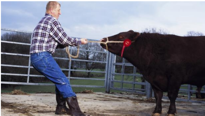
Short Burst Picture

Alternatively think of your own ideas. Your ideas are often better than ours!