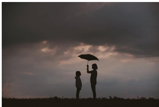
Short Burst Picture

Alternatively feel free to think of your own ideas. We would love to see your writing please!