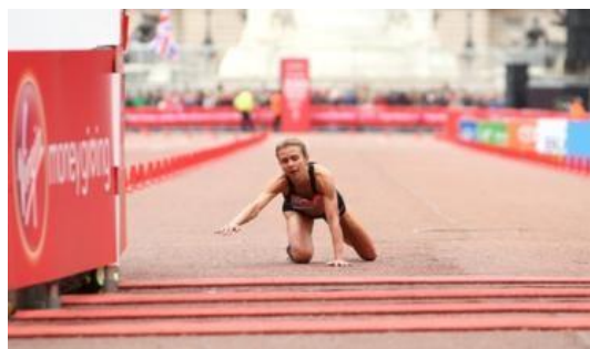
Short Burst Picture

Alternatively feel free to think of your own ideas. We would love to see your writing please!